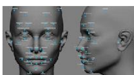
Image Processing and Pattern Recognition is a very important research area. It has many practical applications which have direct impact on the mankind. Few of them are Medical Imaging, Biometrics, Quality assurance of food grains, Industrial inspection of goods, Bio-medical engineering, Surveillance etc. It is important to understand the basic principles as well as advancements in this area in national and international contexts. This symposium intends to impart theoretical as well as application based knowledge in this area.